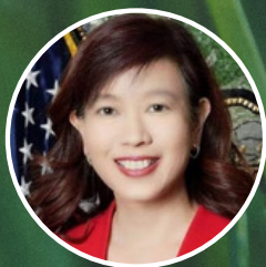
MAYOR LILY MEI CITY OF FREMONT HONORARY HOST