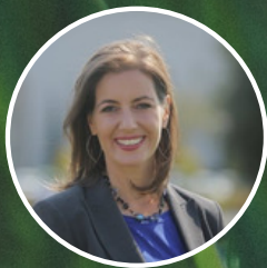
MAYOR LIBBY SCHAAF CITY OF OAKLAND HONORARY HOST